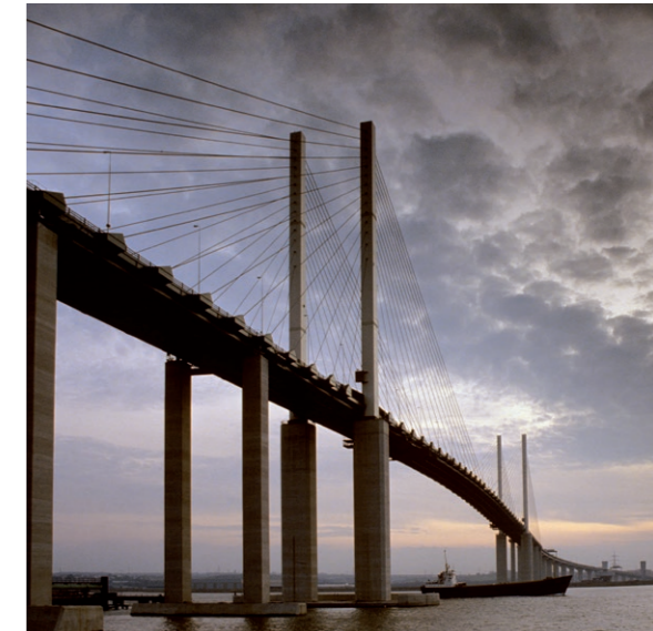
Queen Elizabeth II Bridge, Dartford