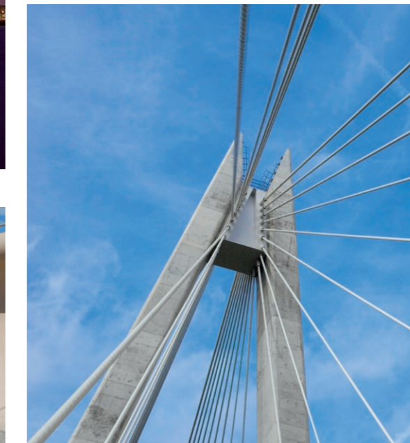
Second Severn Crossing, South West England/South East Wales

The use of Regen in concrete used for bridge construction is extremely beneficial. Minimising heat of hydration to reduce thermal cracking is of critical importance in mass concrete pours. High temperatures in concrete can generate stresses that could result in early-age thermal cracking. The use of Regen reduces the heat of hydration and acts as an effective solution to the problem.