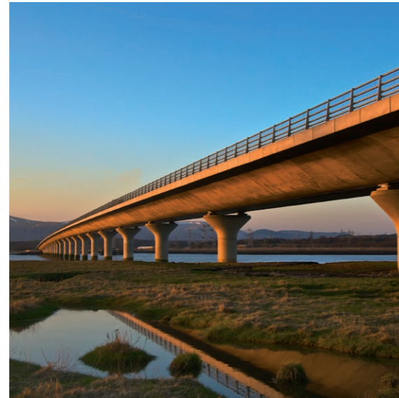
Kincardine Bridge, Fife, Scotland