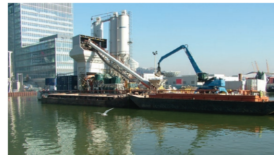
Floating concrete plant, Canary Wharf