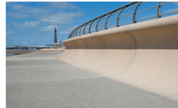
Sea Defences, Blackpool

Regen is a cementitious material that is mainly used in concrete. It is manufactured from blast furnace slag, a by-product from the blast furnaces that produce iron. The benefits of using Regen in concrete include: