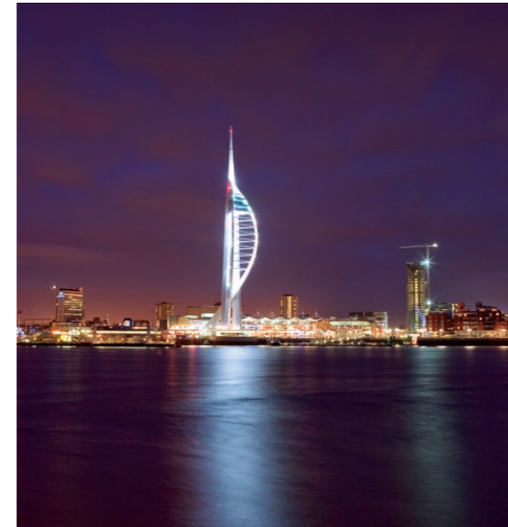
Spinnaker Tower, Portsmouth